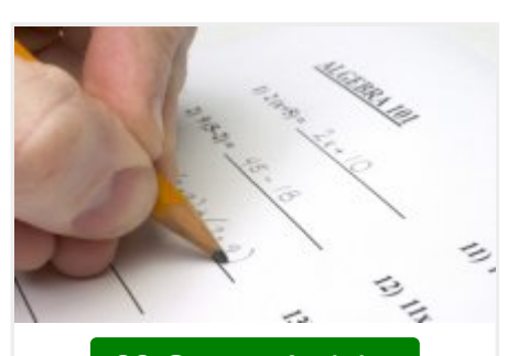
88 Course Activity