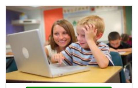
112 Course Activity