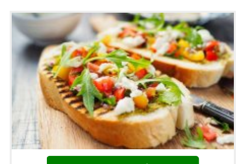
2 New Students