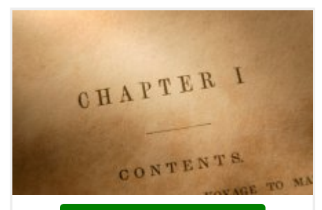
1 New Student