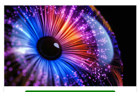
253 Course Activity

Color Theory, Color Mixing, and Technique