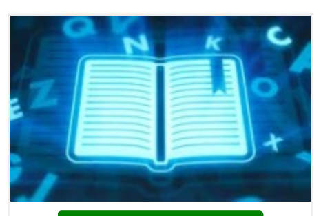
2 New Students