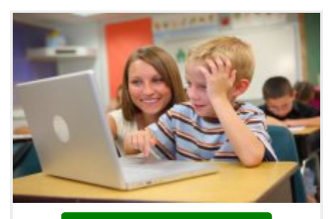
2 New Students