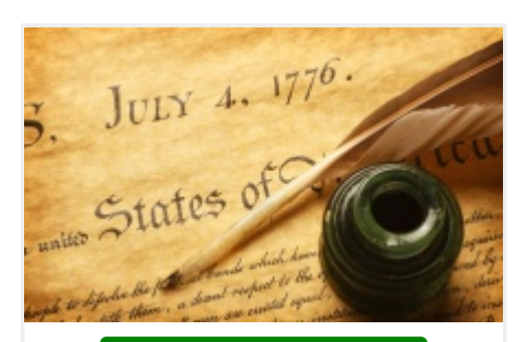
445 Course Activity