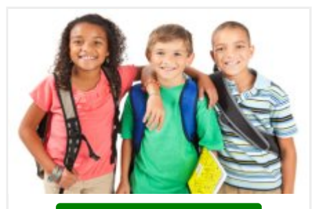
2 New Students