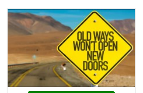
184 Course Activity

Color Theory, Color Mixing, and Technique