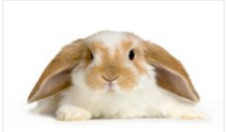
96 Course Activity