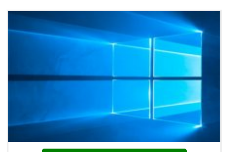
2 New Students