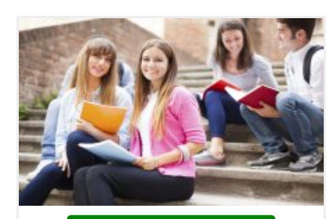
2 New Students