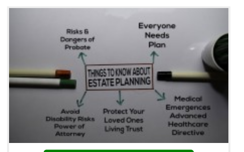
2 New Students