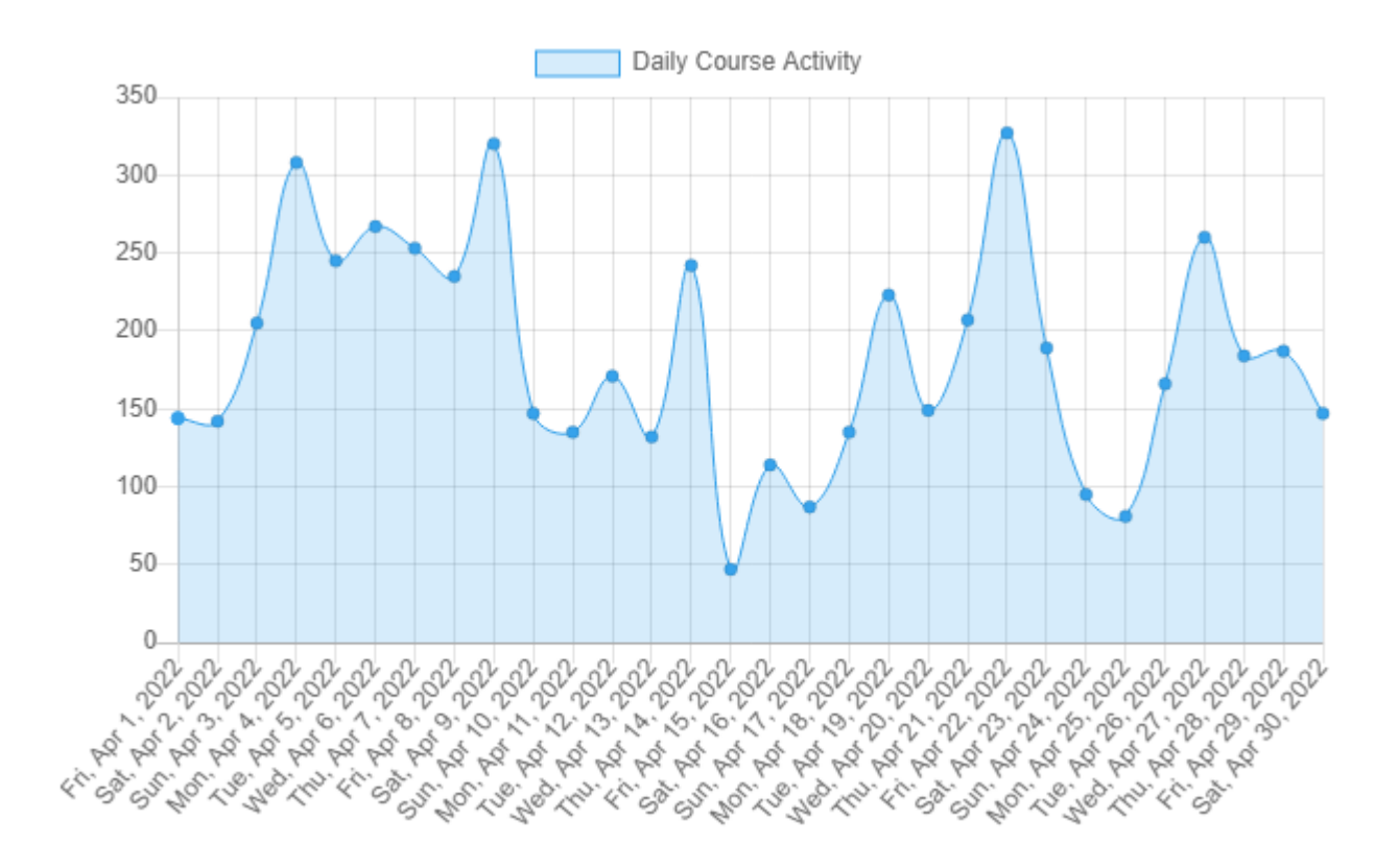
From April 1, 2022 To April 30, 2022