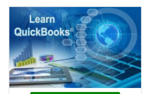
2 New Students