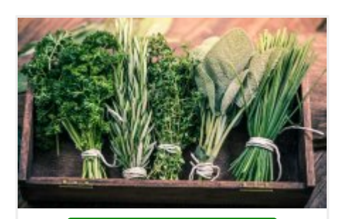
2 New Students