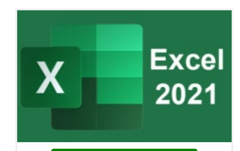
113 Course Activity