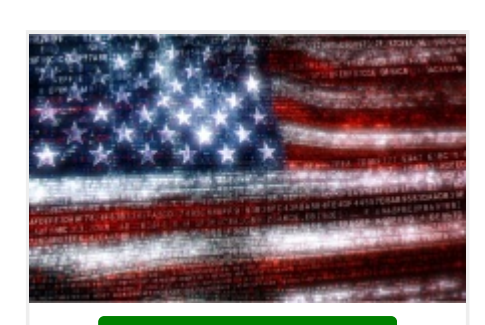
2 New Students