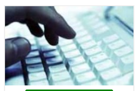
2 New Students