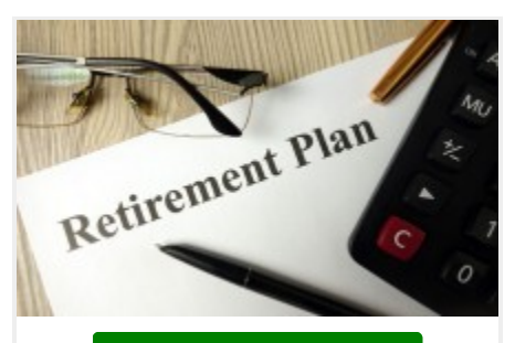
2 New Students